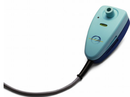
The airway occlusion module - Shutter

The system is capable to perform all lung function test procedures as described in the book "Infant Respiratory Function Testing" (1) and in the ATS / ERS standards (2, 3, 4).