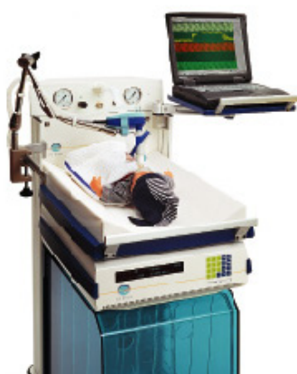
Fully loaded system (RV-RTC module)