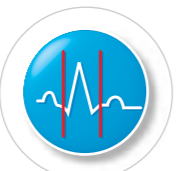
Post recording functions