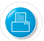
User definable report