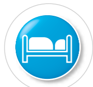
Functions at rest