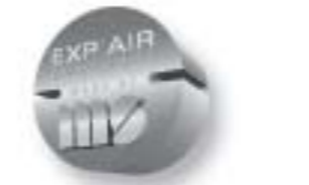
PFT & CPET SINGLE PLATFORM

Most complete and intuitive software providing the most flexible solutions true value for all customers and all environments