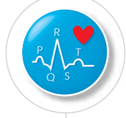
Arrhythmia detection & classification