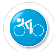
Functions for exercise testing in real time