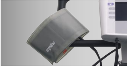
Automatic blood-pressure measurement