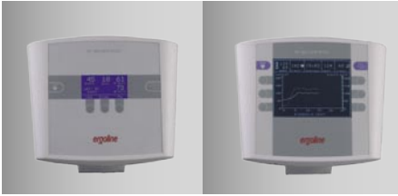
Different operating units (P and K)