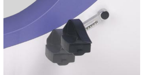
Adjustable foot pedal length