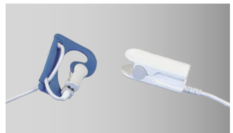
Oxygen saturation measurement