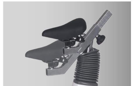
Saddle adjustment for child ergometry