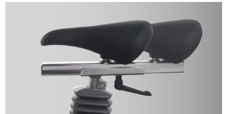
Horizontal saddle adjustment