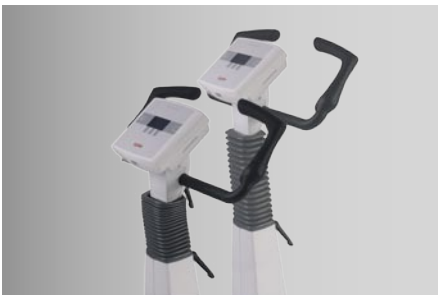
Variable handlebar height adjustment